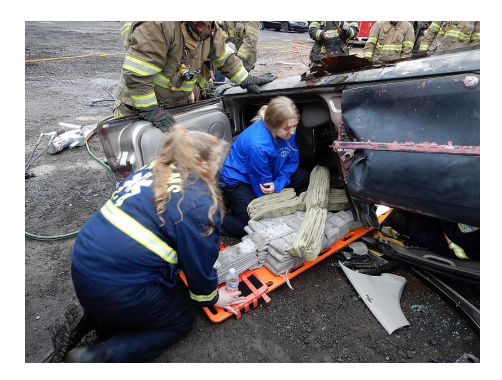
EMT students practice removing a patient from a wrecked car in a training session