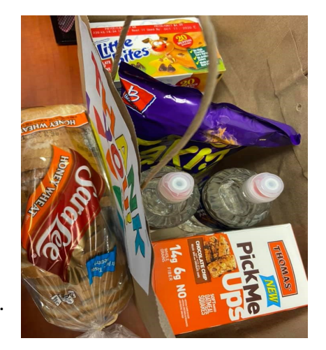
Snacks delivered to the Elizabethtown station from Mount Calvary Church in Elizabethtown

Subscriptions cost $80 for a family, $65 for a couple, or $50 for a single person. See the mailer that will arrive soon for full details.