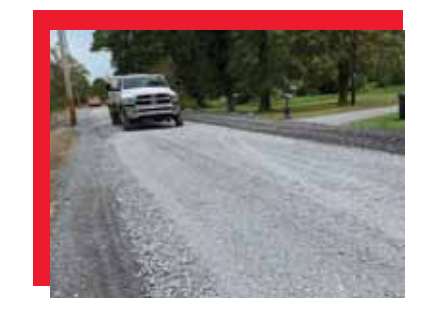
Above: Beverly Road in progress Below: Beverly Road after

2020 will bring about more reconstruction and repair work. Quarry Road and Trail Road North get significant attention from our crews ahead of 2021 paving. The largest impact will be seen on Harvest Road, which will undergo widening and reconstruction next year. This is a major project that has been a long time coming. To see the upcoming projects and the 5-year improvement plan, visit the "Roads" page at mtjoytwp.org.